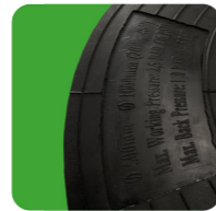
Technical Details Label