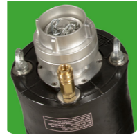
Connection Type ( R 1/4" ) & Storz