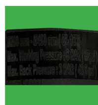
Technical Details Label