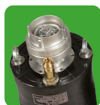
Connection Type (R 1/4" & Storz)