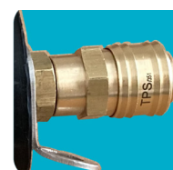
Connection Type (R 1/4")