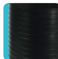
Friction Increasing Design