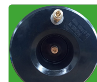
Bagel Shaped Design